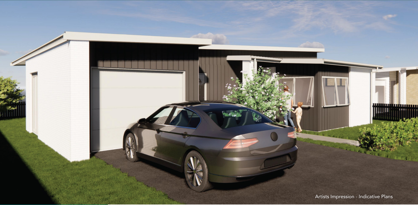
Artists Impression - Indicative Plans